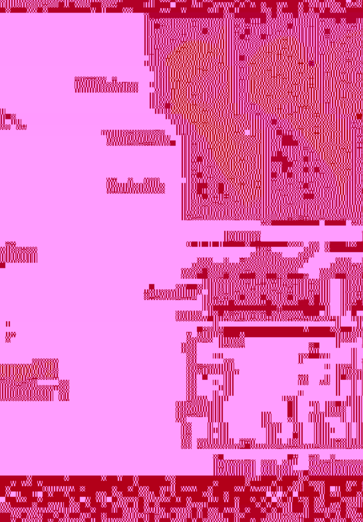
Figure 3: Genetic map of the rice genome showing the location of the Fusarium head blight resistance gene cluster on chromosome 11.