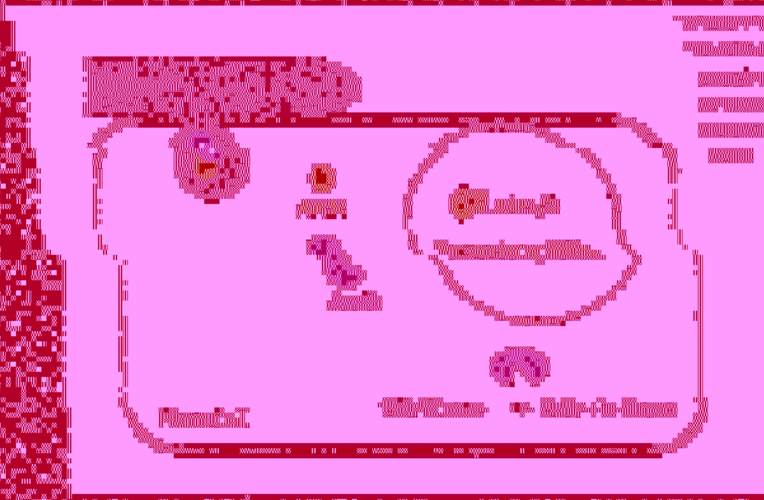
Figure 2: Schematic diagram of the rice genome showing the location of the Fusarium head blight resistance gene cluster on chromosome 11.