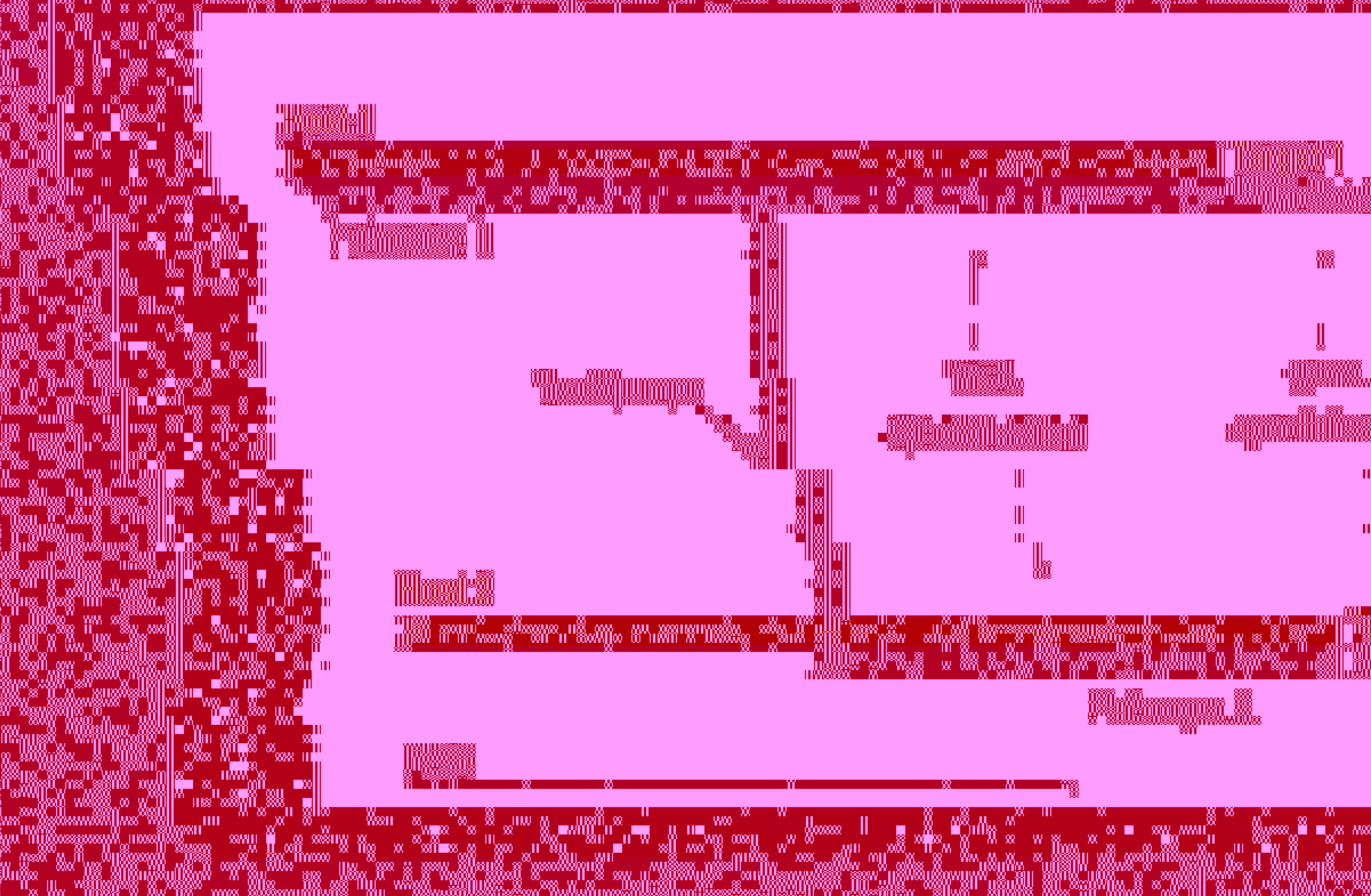
Figure 4: Schematic diagram of the rice genome showing the location of the Fusarium head blight resistance gene cluster on chromosome 11.